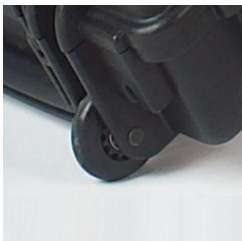
WHEELS WITH BEARINGS