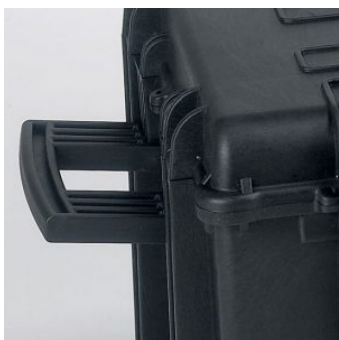
TWO MAN LIFT SIDE HANDLES