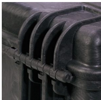
CORROSION PROOF METAL HINGES WITH LID STAY FEATURES