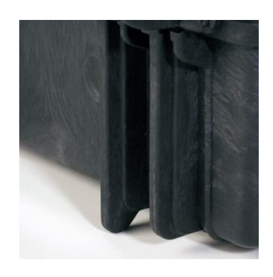
COUNTERBALANCE SUPPORTS (in certain models)