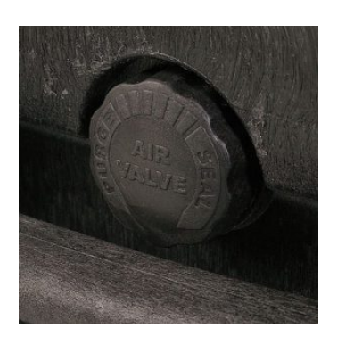
MANUAL PRESSURE RELEASE VALVE The internal stop ring prevents valve from being completely extracted (Art. PURGEVALVE.B)