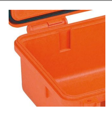
INTERNAL SLOTS Internal slots for optional panel mounting brackets or panel mounting rings