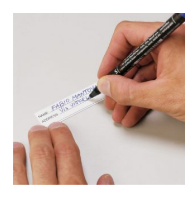
PVC WATERPROOF I. D. REMOVABLE LABEL (Art. LABELCOVER + nr. art.)