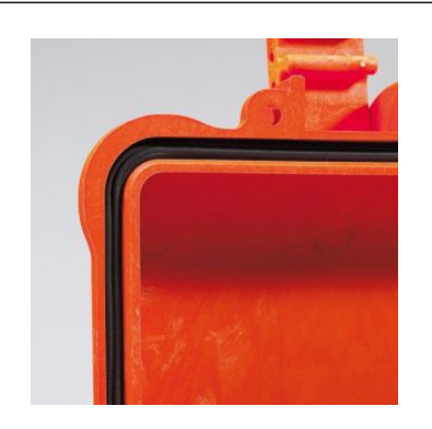
SEALING O-RING (Art. NEOSEAL + nr. art.)