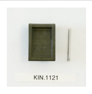
Latch for model 3005