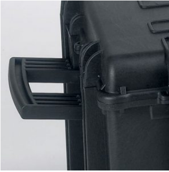
TWO MAN LIFT SIDE HANDLES