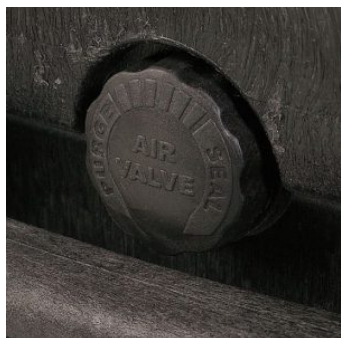
MANUAL PRESSURE RELEASE VALVE

The internal stop ring prevents valve from being completely extracted (Art. PURGEVALVE.B)