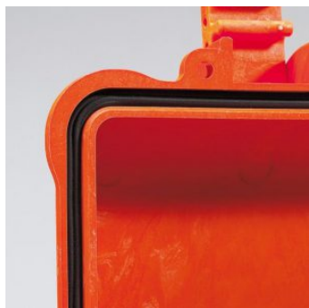
SEALING O-RING (Art. NEOSEAL + nr. art.)