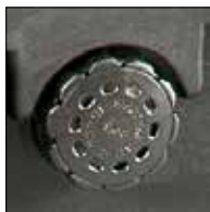
Automatic purge valve