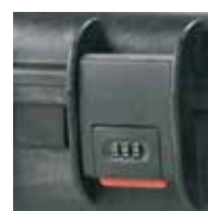
3-digits locks (optional)