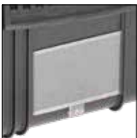
Shipping label holder