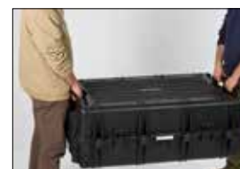
Two man lift large folding side handles

For certain applications the case can be retained and secured by mean of a specific metal bracket. (# EX-METALPLATE).