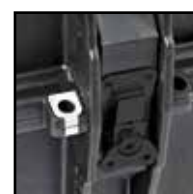
Heavy duty metal latches and stainless steel padlockable points