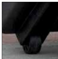
Self-oiling free running wheels