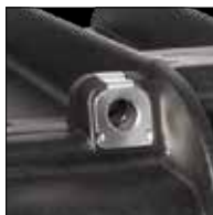
Stainless steel reinforced padlockable points