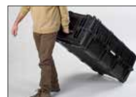
4 self-oiling free running wheels