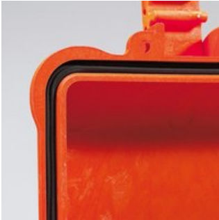
(Art. NEOSEAL + nr. art.)