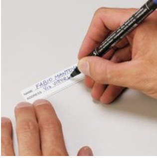
(Art. LABELCOVER + nr. art.)